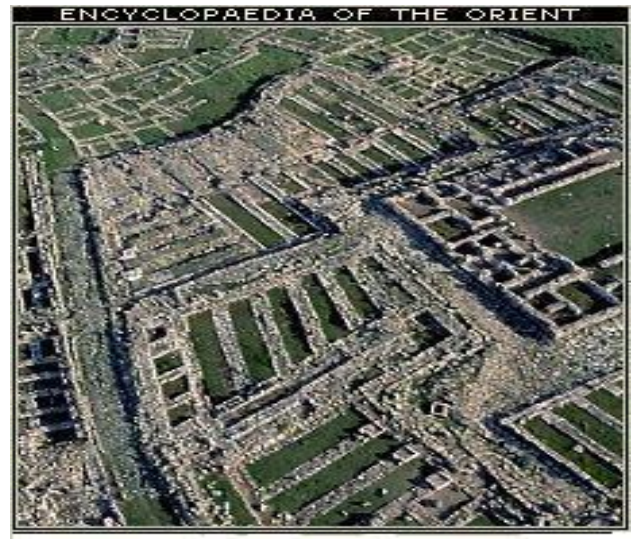
A view of Hattusas

In the Hittite records, a prince with the name Anitta is considered the traditional founder of the Hittite dynasty, but it took some more time to establish an organized state which was later to be established by Hattusilis I, who built the town Hattusas (at Boğazköy in Çorum).